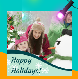
Holiday Fun Page 8