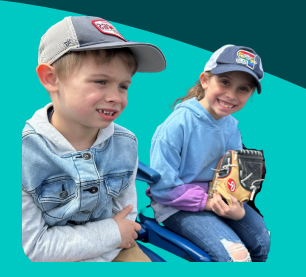
Sea Dogs Game pg. 7