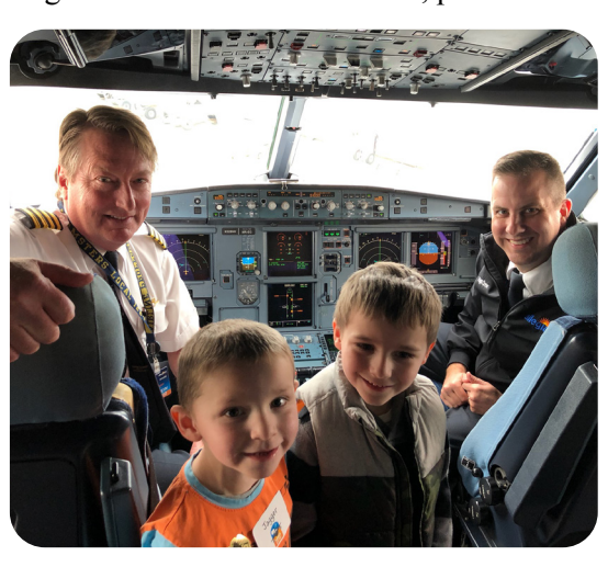
continued on page 3

the airport near you, they can provide tours so families can become acquainted with the environment and can answer all your questions. TSA also has the TSA Cares program, an employee can assist families through the